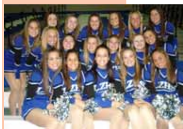
Varsity Poms Dance Team

The Lake Zurich High School Varsity Poms Dance Team brought home two first-place trophies for its performances in the AAA Varsity Hip-Hop and Pom divisions at the Team Dance Illinois competition held at Batavia High School on Sunday, December 3. At this first competition, their scores in both Hip-Hop and Pom have already qualified them for the state competition!