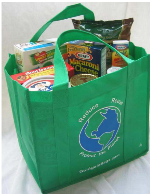
Can this bag really save the Earth?

The students were responsible for developing their new company, researching products, developing promotional information, ordering, stocking, sales, and the other business functions of a new and growing company. The learn and earn