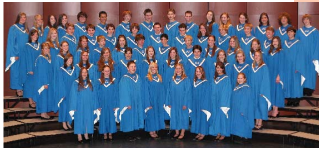
LZHS Concert Choir

The Lake Zurich High School Choirs—including the Treble Choir, Men's Choir, Cadet Choir, Women's Chorale and Concert Choir—will perform their March Choir Concert on Monday, March 12, beginning at 7:30 p.m., in the Performing Arts Center (PAC) at Lake Zurich High School. The concert is free, although monetary donations will be accepted. The PAC is located at 300 Church St., Lake Zurich.