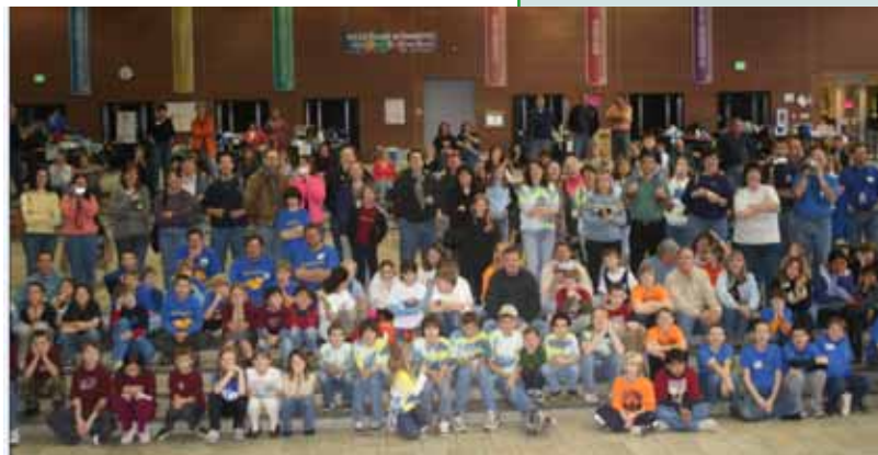
An anxious crowd awaits the results of the day-long FLL competition.