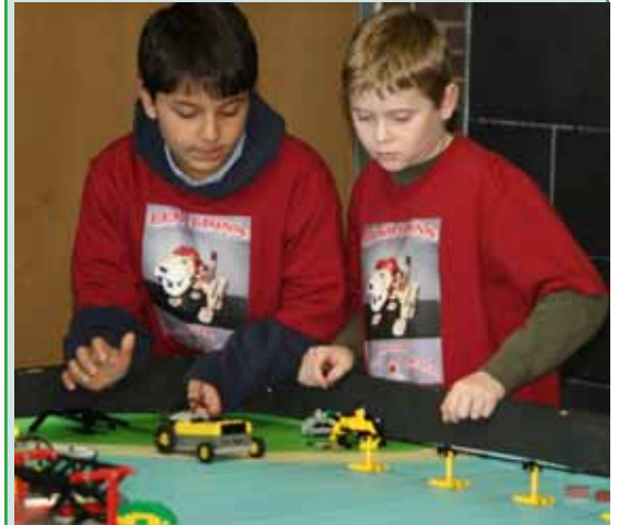
Two members of the Lego Lions watch their underwater robot go through its paces.