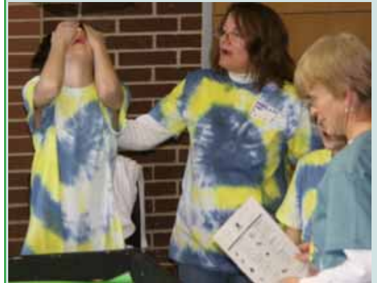
A student robot builder reacts to a less than perfect round of competition.