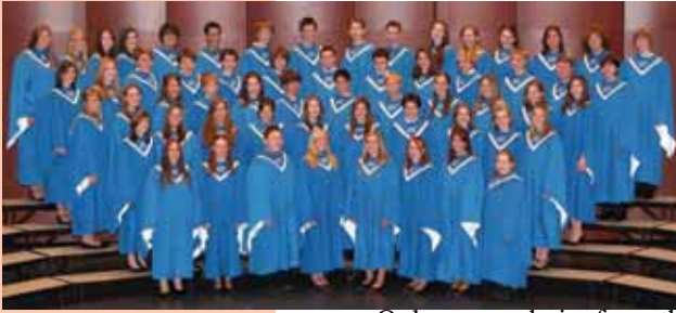
LZHS Concert Choir

The Lake Zurich Concert Choir will serenade the state's music educators at the annual Illinois Music Educators Association All State Convention on January 27 at the Riverside Church in downtown Peoria, IL, beginning at 12:30 p.m.